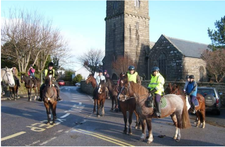
More Happy Riders ready for the ride

The first horse hike of the new year from Madron had an overwhelming attendance of 19 members starting out on a really quiet and easy "warm up" ride. We assembled outside Madron church on Sunday 9 January on a beautiful day. The sun was shining and no wind made for a lovely pleasant ride out.