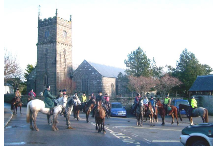
19 riders set out on the new year's horse hike from Madron