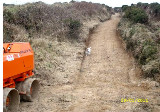
Work In Progress on Embla Vean Bridleway, Towednack 18

Good News - Embla Vean Bridleway, Nancledra to the moors. This was washed out by the Zennor Floods 2 years ago and has been closed ever since. Cornwall Council has done a complete restoration on this bridleway. They have restored a good wide track right up to the moor, and renovated and improved all the old leat drainage system. It was very wet whilst they did the work which gave them good opportunity to see the drainage problems as they did the job.