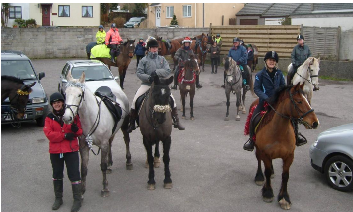
Riders ready to leave the Trewellard Arms