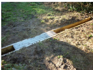
Below, one the many drainage gullies installed.