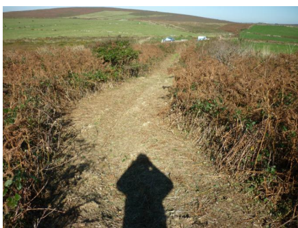
Above, Looking down along the cleared old lane

The NT has agreed to move back the awkward bridleyway gate to allow much safer access on to Chapel Carn Brea. They are also going to cut wide 'firebreak' tracks around the base of the hill that will also improve horse access. We have now achieved a rather pleasant circular ride. We will still look for further improvement to horse access in the future. Dartmoor ponies are currently being used to graze off the hill. The NT are planning more clearance on the hill that should provide better access for riders and grazing for the resident ponies.