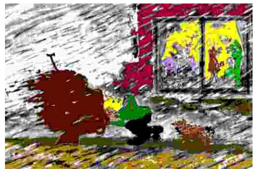
Aren't Horses Fun