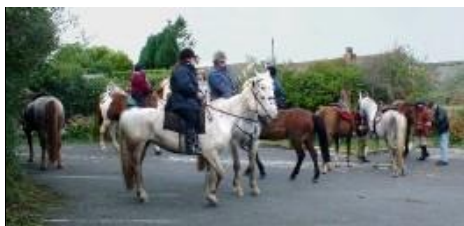
Ready to go after lunch

past Trannack Farm and on to the Fountain Inn for lunch. Two more members joined us here for sausage and chips on the hoof.