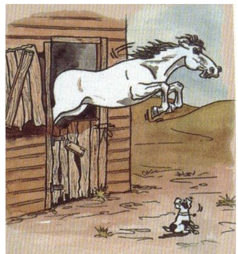
A spot of jumping practice!