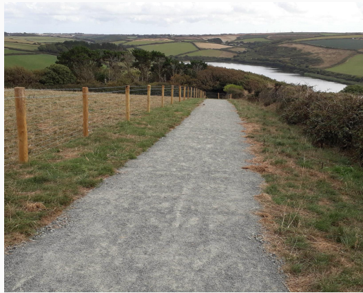
Photo of section of new bridleway

You may remember that the coastal byway fell into the sea late 2017 meaning the horse riding bridleway route to Porthleven Leven was lost once again. The National Trust have now provided a replacement bridleway link that gives fantastic views. They have also provided a lower footpath route to replace the coastal byway.