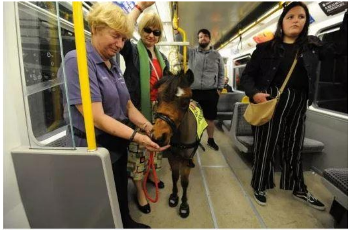
Digby has taken his first ever train journey

A partially sighted woman is allowed to take Digby the miniature horse on the Tyne & Wear Metro system in Newcastle. Digby is just finishing his unique training as the UK's first ever guide horse as he experiences the sounds of trains, stations ticket gates and lifts.